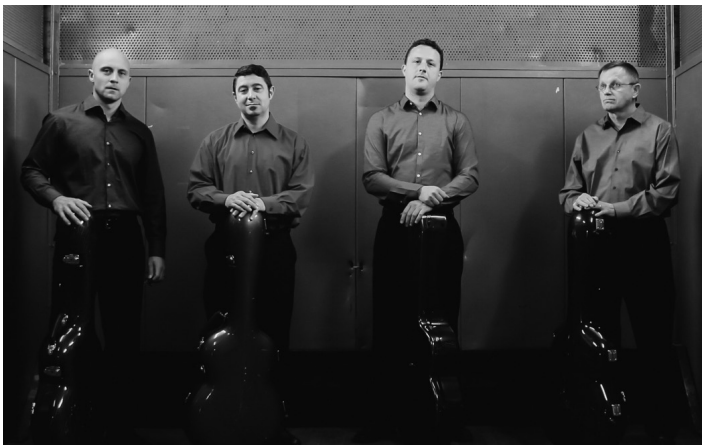
Oregon Guitar Quartet

Questions? Email us at nwnguitarfestival@gmail.com