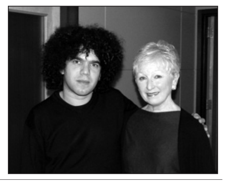
Seattle Classic Guitar Society