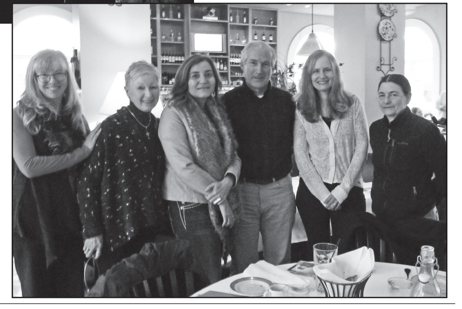
Seattle Classic Guitar Society