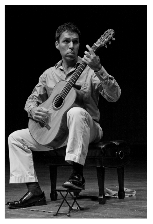
Y la práctica veintiséis horas cada día.