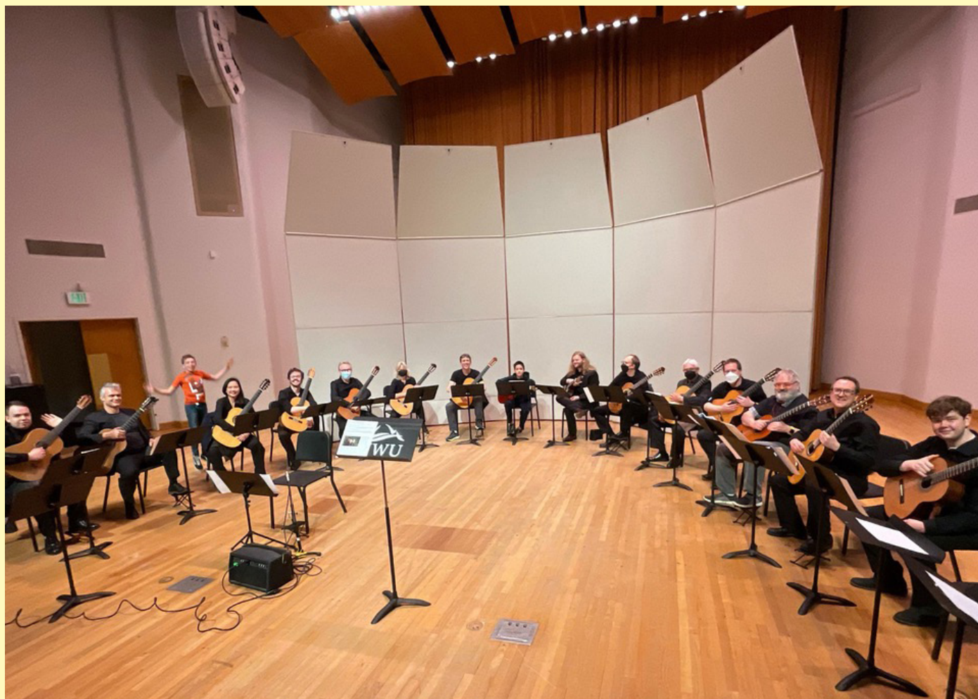
2023 NW Guitar Festival – Guitar Orchestra